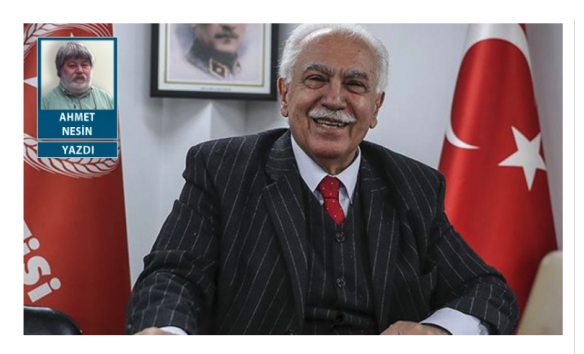
Bilmediğim ve gitmediğim Perinçek davasından ceza aldım!..